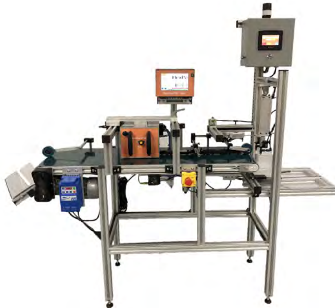
Stand Alone Machine to Pick and Place Pouches/Zippered Bags (shown integrated with FlexPackPRO 420c TTO printer)